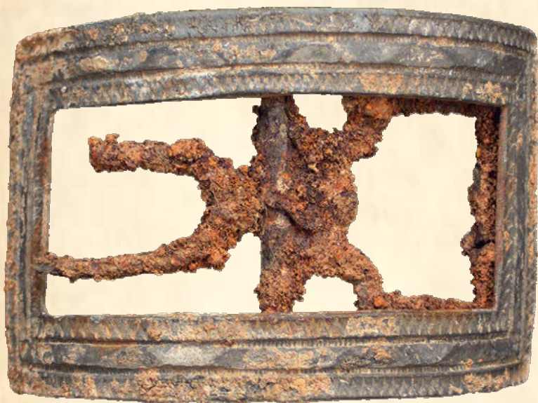
Shoe buckle recovered from a Catawba house cellar.