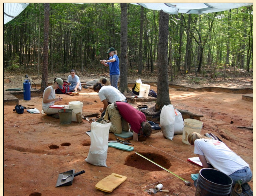
UNC field school students excavating pits in a Catawba house.