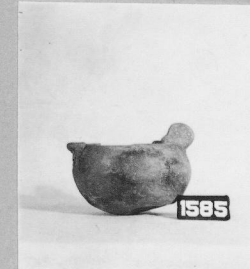
Eastern Arkansas: Polished drab. Rim effigy bowls. A1-B2, animal; B3-E4, bird, flat-headed type.