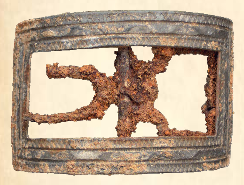
Shoe buckle recovered from a Catawba house cellar.

York County, South Carolina May 17-June 16, 2017