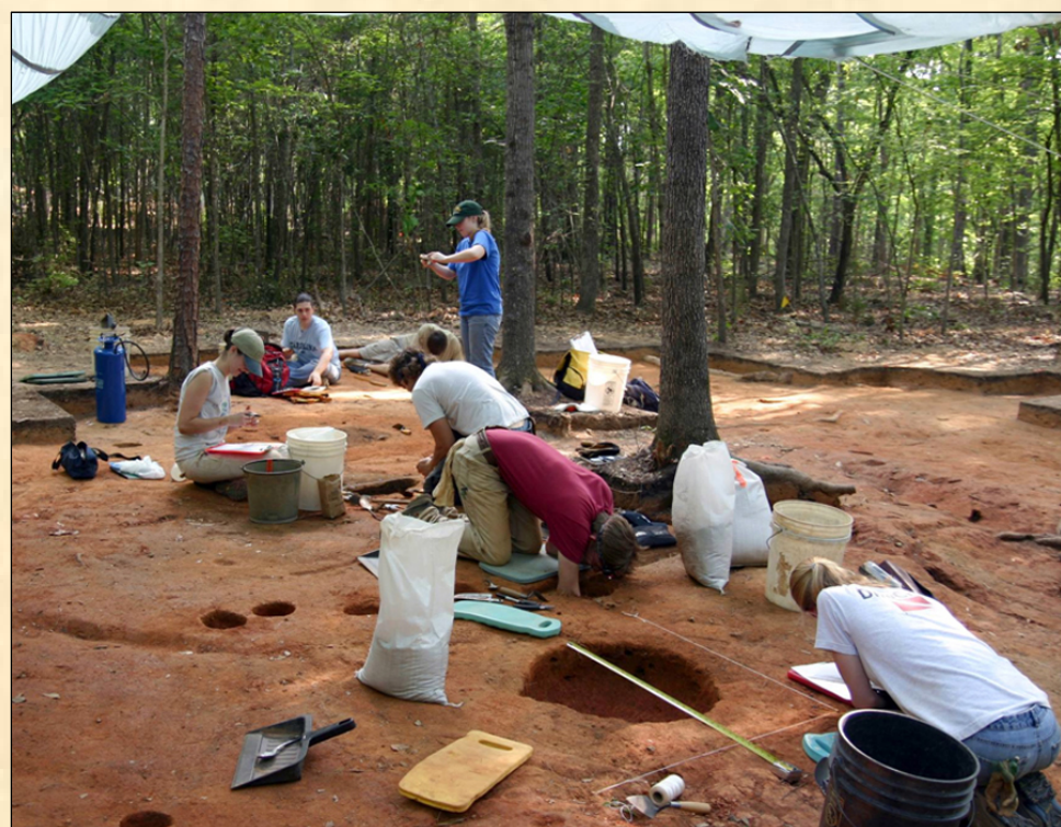
UNC field school students excavating pits in a Catawba house.