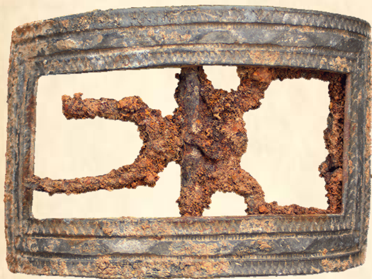
Shoe buckle recovered from a Catawba house cellar.