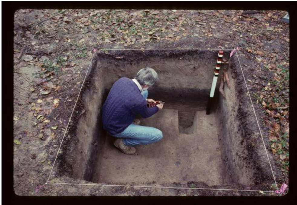
Figure 9-3. 1994 test square excavated in the Hariot Woods Nature Trail showing buried "A" horizon, facing south.