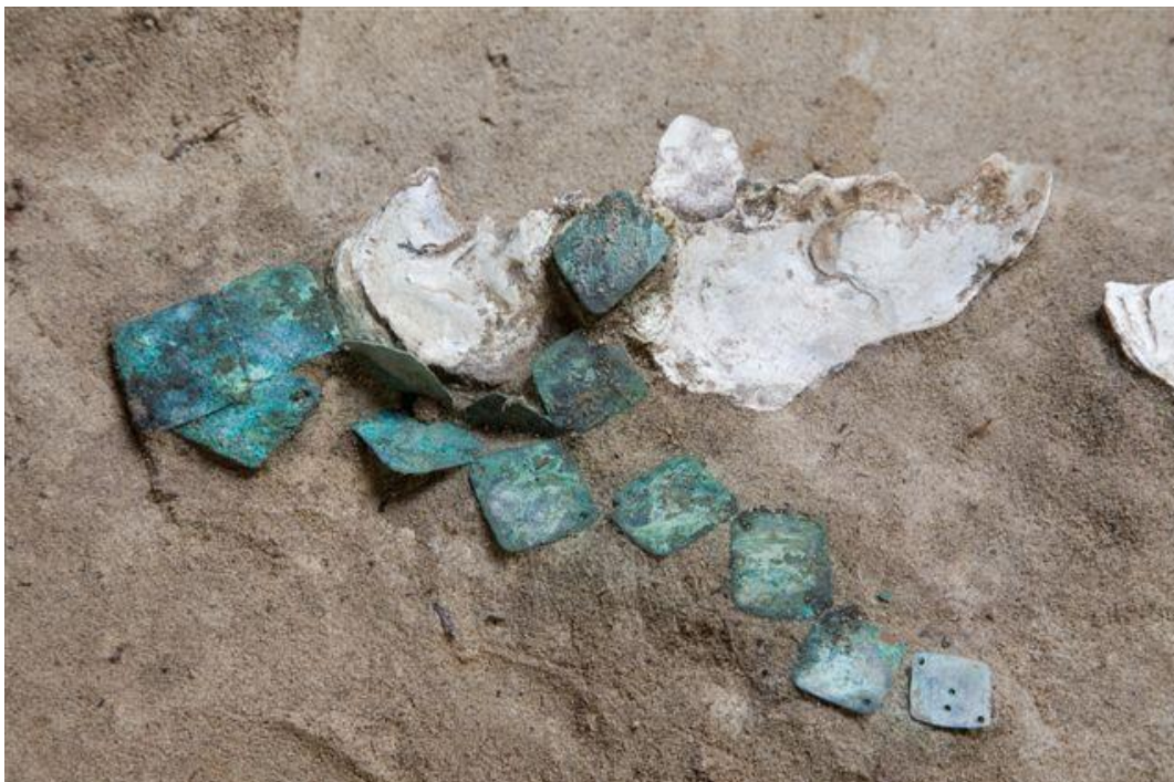
Figure 9-4. Detail of Feature 13 showing copper plates in situ.