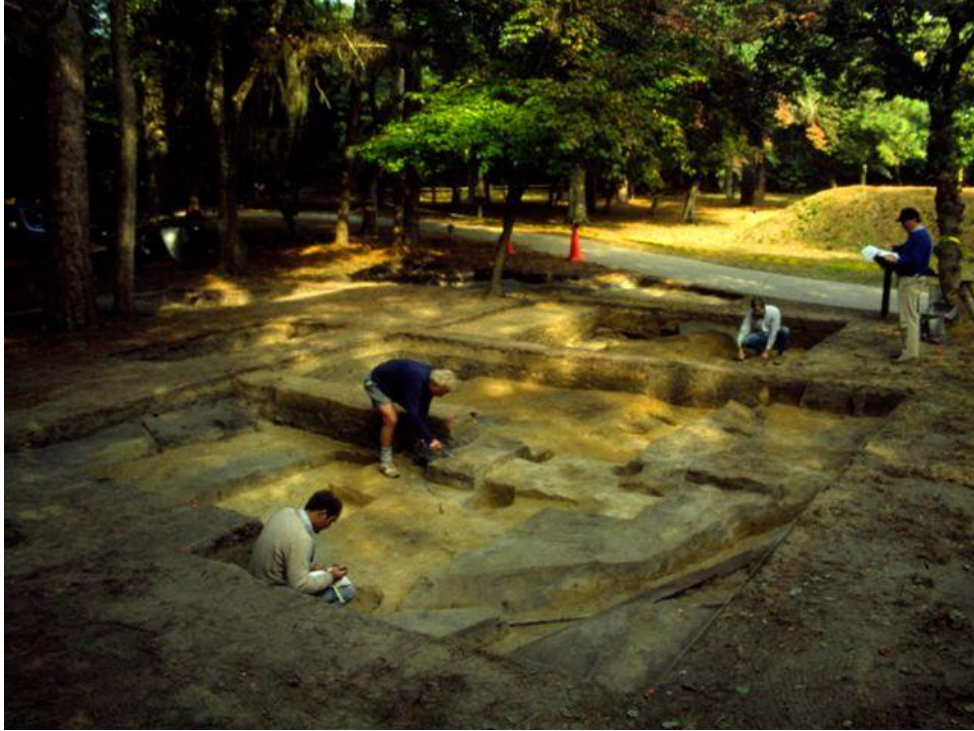
Figure 9-2. VCF excavation of 1585 scientific workshop area with undisturbed “A” horizon in the center of the excavation, facing northeast.

from copper), chemical glassware, and crucible sherds encrusted with copper smelting residue including one crucible sherd with a prill or small bead of copper attached to it.