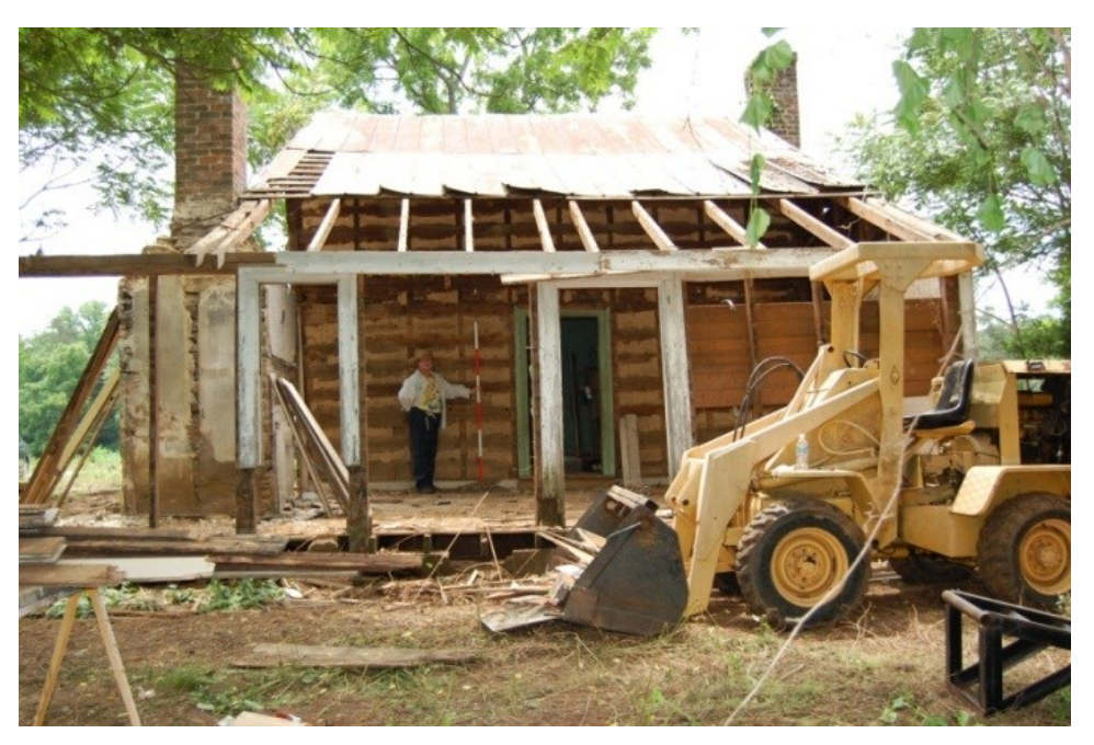
Figure 20-2. Dismantling Hines Log Cabin in Guilford County, 2011.

fighter practice, or are slowly returning to the earth through sheer neglect (Figures 20-1 and 20-2). These sites are being lost an alarming rate, even though focused rural preservation efforts have been on-going for over 30 years (Southern n.d.).