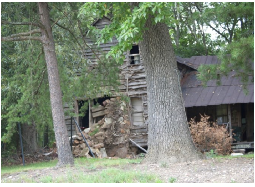
Figure 20-1. Abandoned farmhouse in Guilford County, 2011.